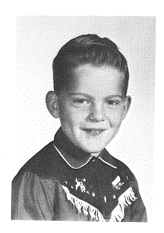
he's found it! boys village a place to call home...